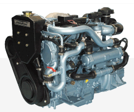
Naturally Aspirated 4 cylinder